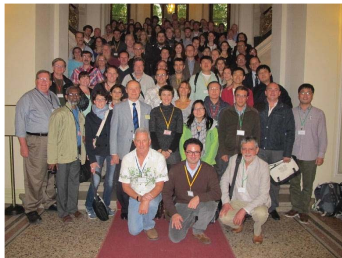
The AIG-10 Group

Based on the reflections that the organizers received during and after the conference, the participants were satisfied, and had a happy and successful one week in Budapest. The number of presentations was sufficient to organize specialized sessions that reached the critical mass needed to have colleagues interact effectively within the same topic that makes a meeting successful for the individual participants.