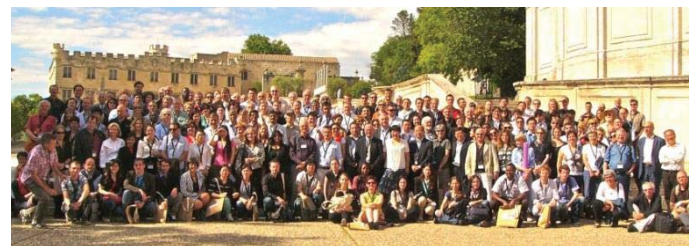
WRI-14 conference participants