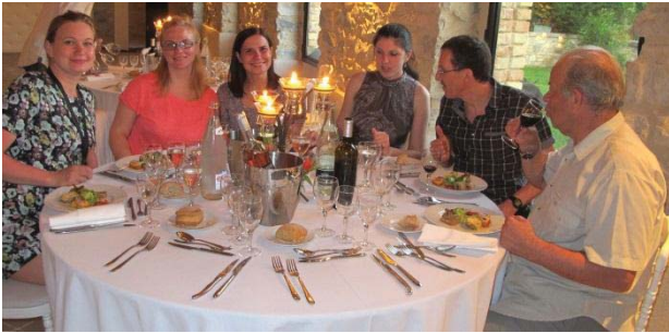
Russian participants at WRI-14 banquet

dinner that was held on Barthelasse Island. The outdoor pavilion was next to the famous Pont d'Avignon popularized by the famous French medieval song ( Sur le pont d'Avignon on y dance, on y dance.... ). These parties were excuses for two rousing good times, as the photos of the evening suggest.