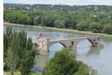
Pont du Avignon

No successful meeting is complete without a good party or two. On Wednesday evening, an official mid-conference banquet was held in the Lirac vineyards and on Friday evening we had the closing