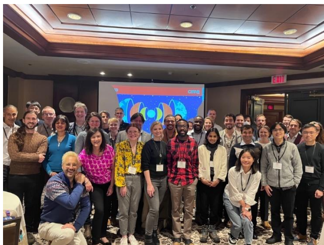
The Earth 4D Program 2023 Fall Meeting in Toronto