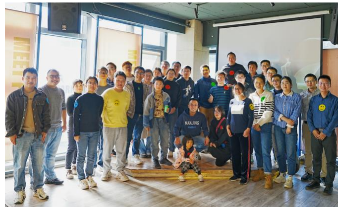
ICIER group photo (2023 November)

feasible. We are looking forward to hiring more international researchers, eagerly anticipating their contributions.